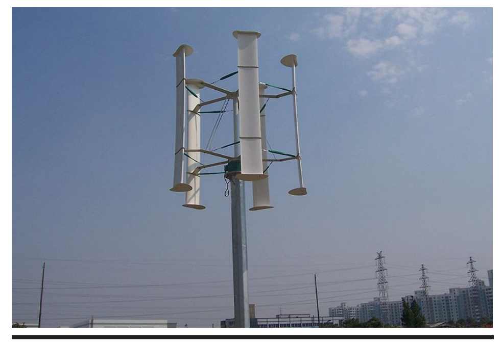
Figure 2: A Modern H-Rotor Darrieus Wind Turbine

Because VAWTs can intake wind from any direction, they can operate in turbulent and variable wind conditions far better than HAWT designs (Berry, 2009). In fact, VAWTs can often operate in higher wind speeds than their HAWT counterparts which equates to greater energy generation under these conditions. These advantages have led both designers and politicians to consider adding VAWTs to urban environments (Ragheb, 2008). VAWTs often have their gearbox and electrical alternator located near the ground which facilitates easier maintenance. Some new VAWT designs have a coefficient of performance approaching 0.40 and allow for greater turbine density per parcel of land (Allan, 2007). Marsh (2005) notes that new H-rotor VAWT designs may also break the 10 MW barrier as the orientation of the blades coupled with modular manufacturing techniques allow VAWTs to be constructed larger than HAWTs. However, there are reasons why VAWTs have not seen more widespread use in wind farms.