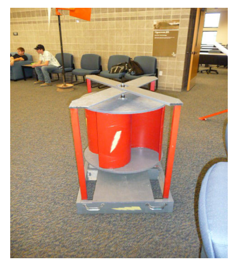
Figure 1: A Homemade Savonius Wind Turbine

generally less than 1. Figure 1 shows a student built Savonius wind turbine.